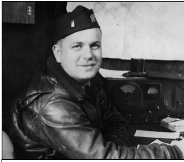
NAS Kodiak, Alaska, October 17, 1943. Duty Officer, VS-70